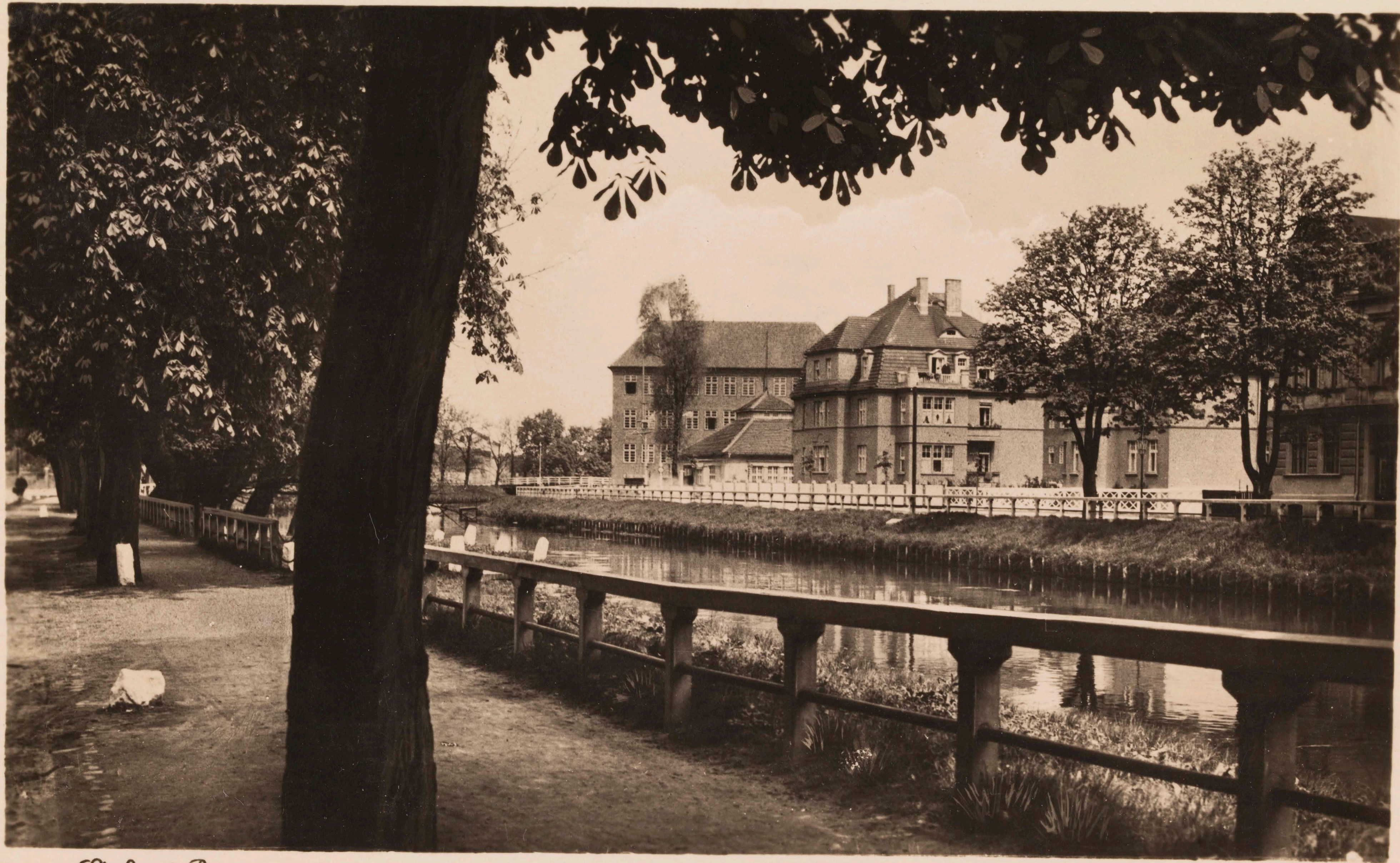
Stolp i. Pom.